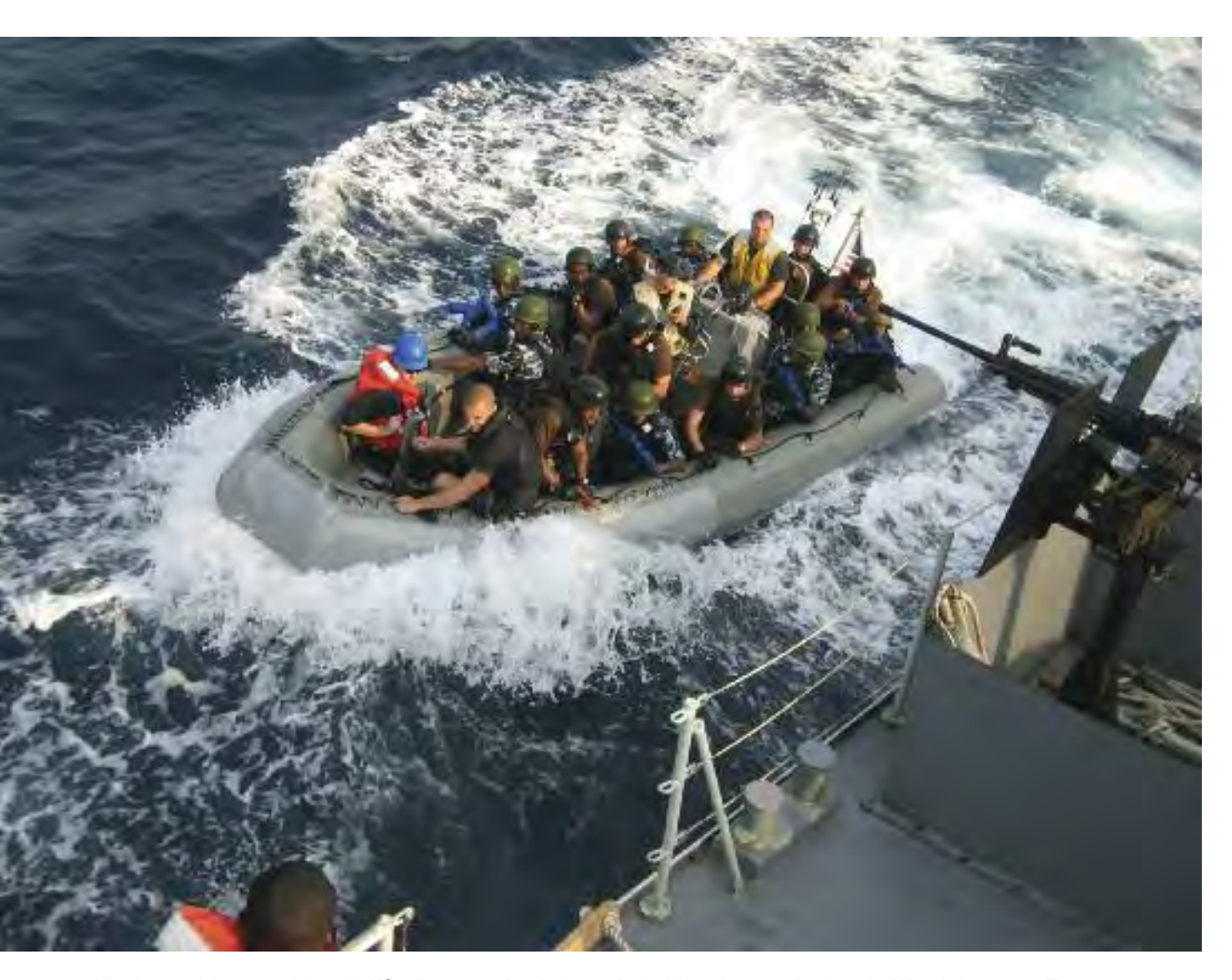
Nigerian special forces training with US sailors to combat the increasingly violent pirate attacks along the West African coast. The 530 miles (853 kilometres) of Nigerian coastline is a lucrative target for pirates. Energy company vessels crowd the waters off the oil-rich Niger Delta, which provides the US with one of its top sources of crude oil for gasoline.

Shipping companies will need not only to protect their vessels but also to ensure that they can still attract high-quality officers and crews willing to sail in the area. This means that crews must understand but not overestimate the risks, and that they and their families are mentally and physically prepared for an incident. Seafarers should understand how best to look after themselves and their fellows if they are kidnapped. Companies must be able to demonstrate that they take their duty of care seriously, and that they will be able to act professionally if a kidnap does occur.