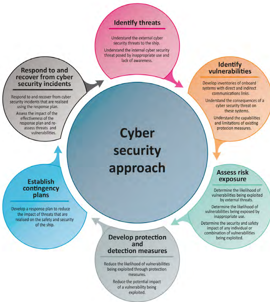
Figure 1. Cyber security approach as set out in the guidelines