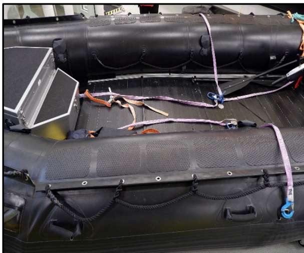
Figure 1 -Zodiac after bladder failure. Deformation to the deck is visible.

This safety alert addresses the importance of proper maintenance and adherence to manufacturer's recommendations for filling/inflating buoyancy chambers on some models of inflatable boats.